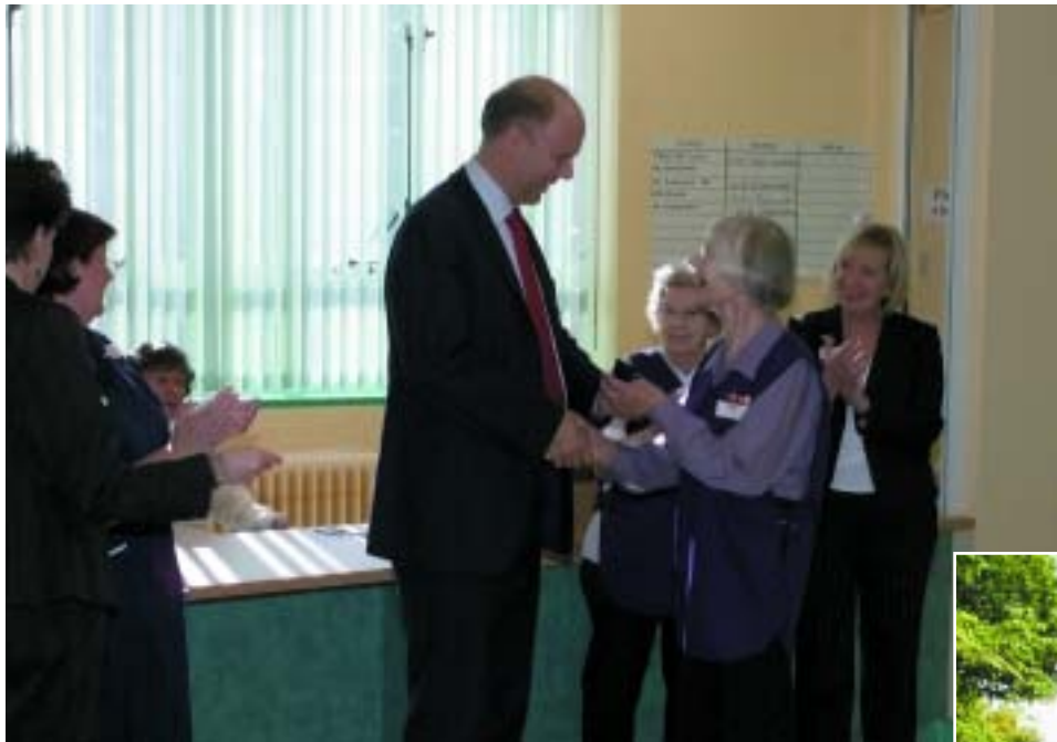
Opening the new reception area, funded by the WRVS, at Epsom Hospital.

Visiting local community, voluntary and charitable groups