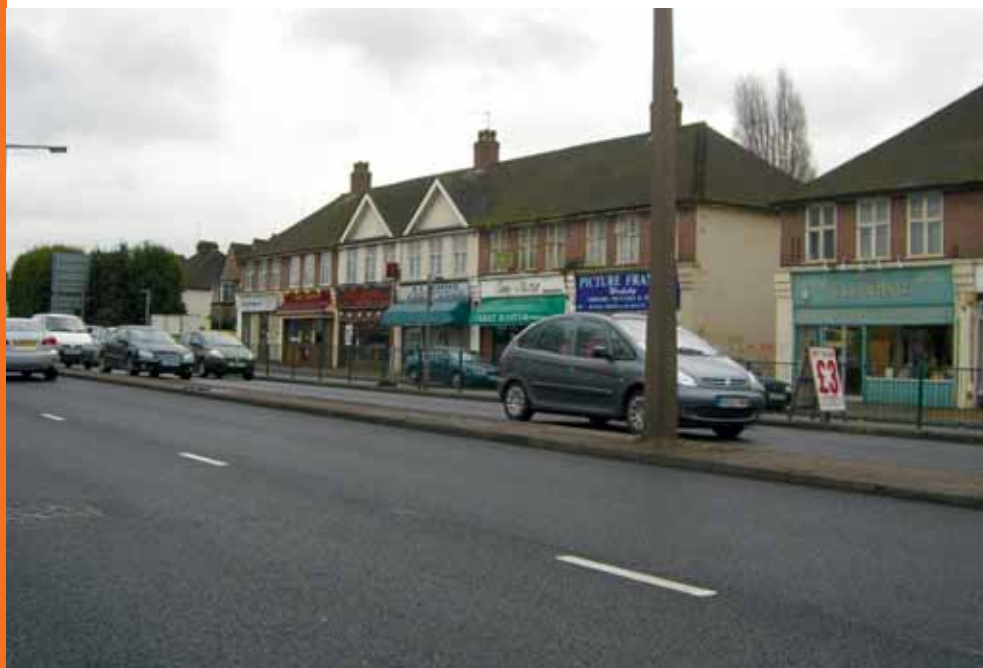
Shops near the junction of Ruxley Lane