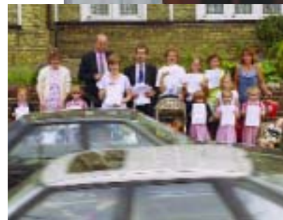
Campaigning with residents for a new crossing over the A24