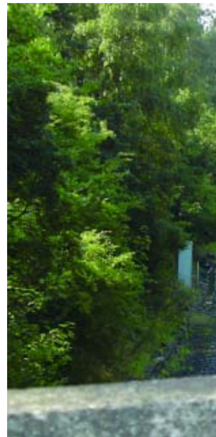
The disused line south of Chessington.

This autumn he is holding meetings with a number of our local transport operators, including South West Trains, South Central, the new rail company that took over from Connex, and the bus company Arriva. He met South West Trains in September, and urged them to move as quickly as possible to make the improvements promised in their application for a new franchise. He is also pressing South Central to make improvements to services and stations on the Epsom Downs line.