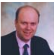
Chris Grayling MP

This bulletin will be published twice yearly, in October and April, and will provide all local residents with an update of Chris's work in the area and about other news and events. It will also provide you with updated information about surgeries and other contact details should you have a problem you need to raise with your MP.