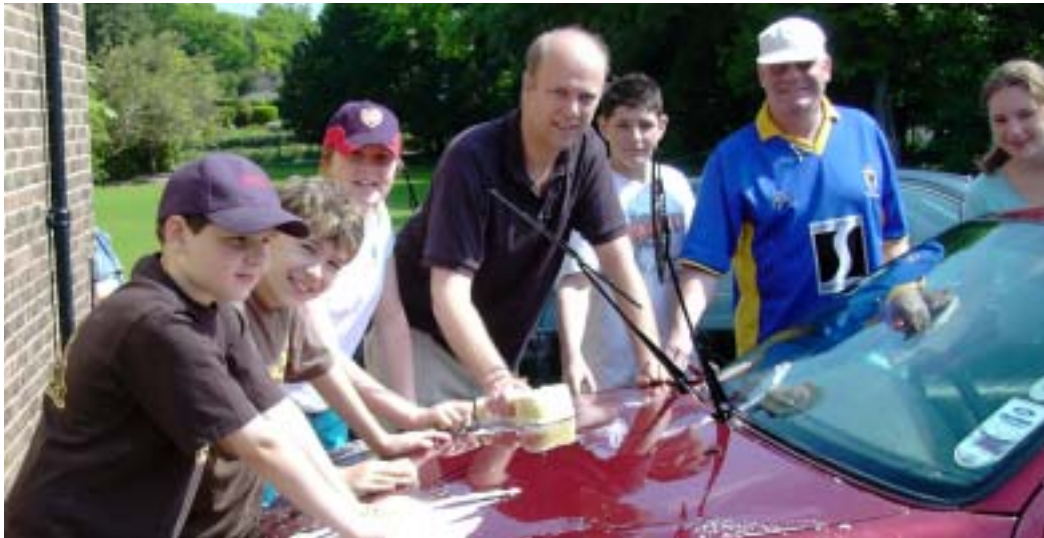
Helping wash cars to raise money for the Chernobyl Children's Lifeline Appeal.