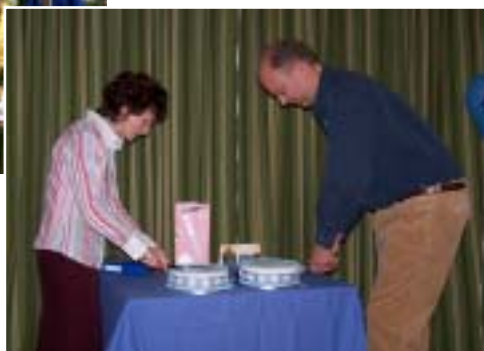
Cutting the 20th birthday cake for the local branch of AFASIC, a support group for children with communication disorders.