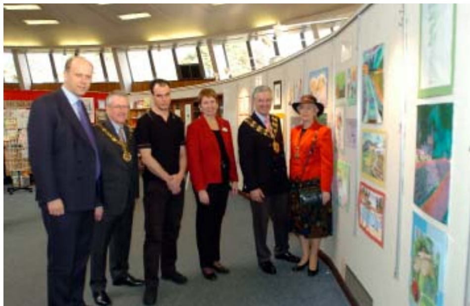
With the Mayor at the official opening of an exhibition of prison art at Bourne Hall.

Chris's website, www.chrisgrayling.net , contains information about the area, local news and details of how to contact him, as well as electronic copies of this newsletter. You can also leave your views on the special bulletin board.