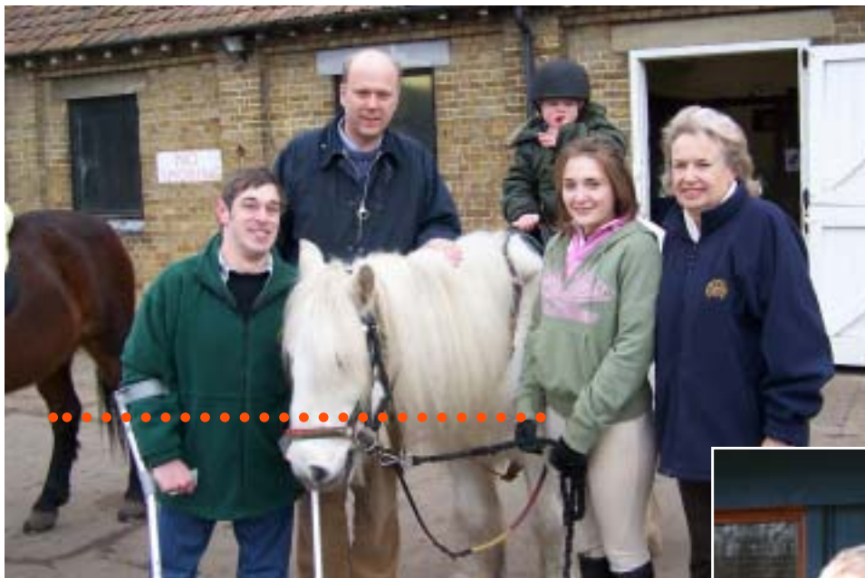
Visiting Epsom Riding for the Disabled to celebrate the purchase of its land from the NHS