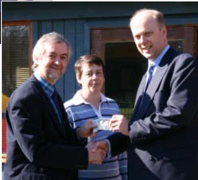
Joining up as one of the first Friends of Preston Sure Start