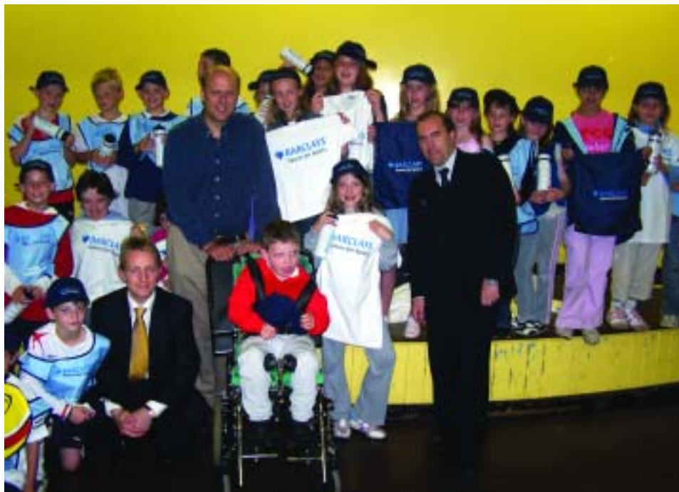
At the presentation of new equipment to the Phab youth group in Epsom

Chris's website, www.chrisgrayling.net , contains information about the area, local news and details of how to contact him, as well as electronic copies of this newsletter. You can also leave your views on the special bulletin board.