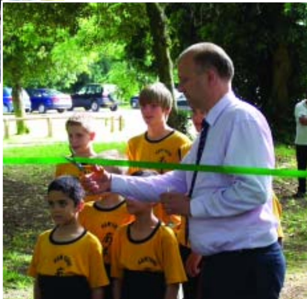
Opening the Nork Trim Trail