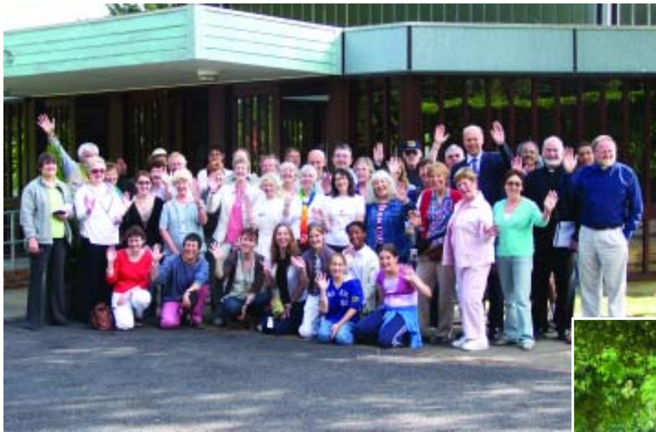
With local Make Poverty History campaigners